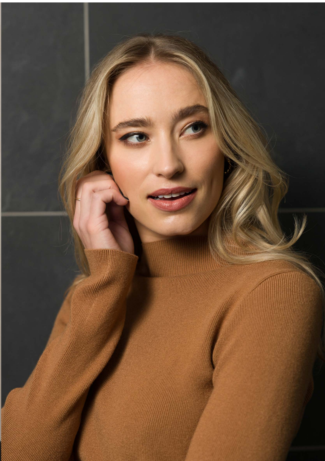
| B L A Z E R S i s k a 4 0 0 1 2 2 0