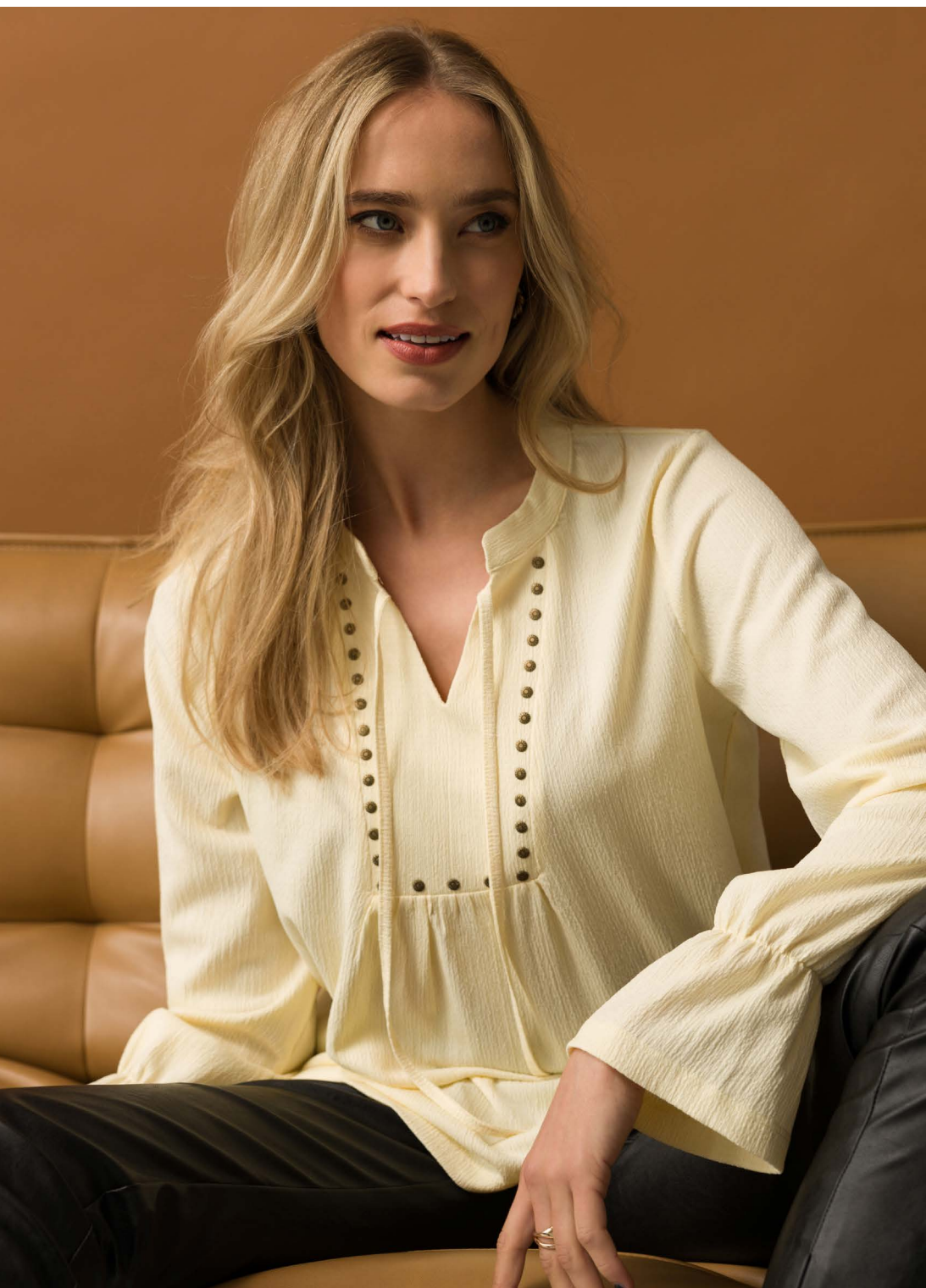
BLOUSE Syll 4001217