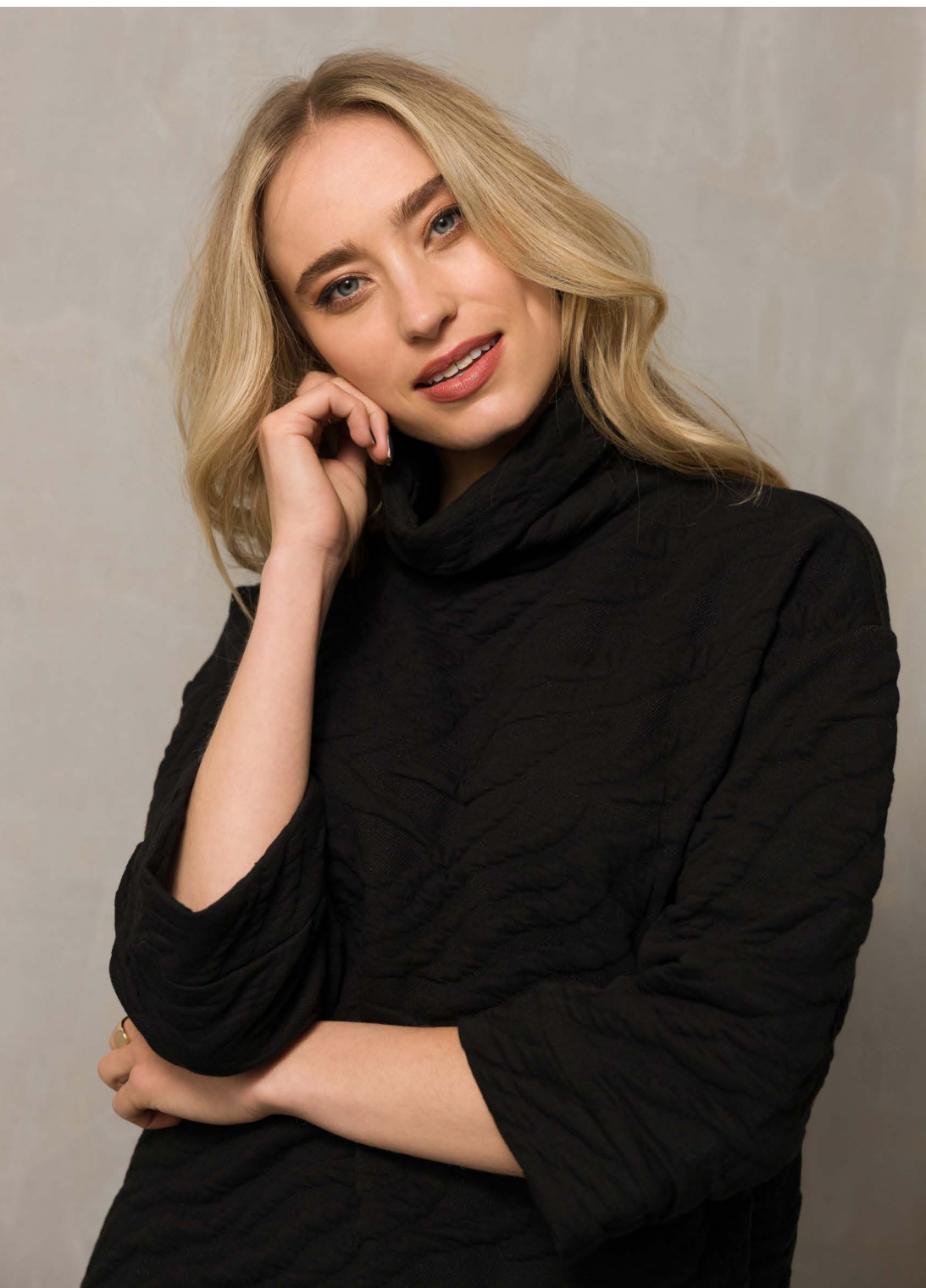
T U N I C S h a r i 4 0 0 1 2 4 9